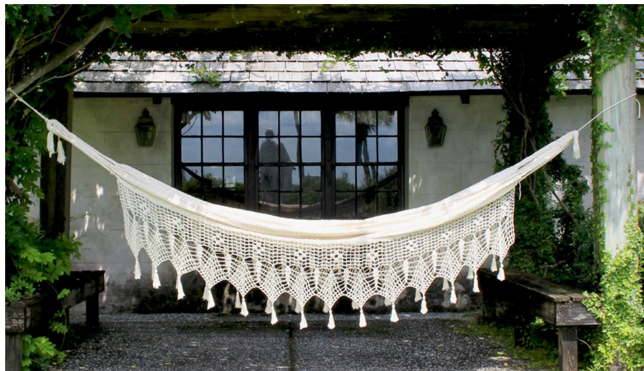
HAND KNOTTED HAMMOCK HK0000