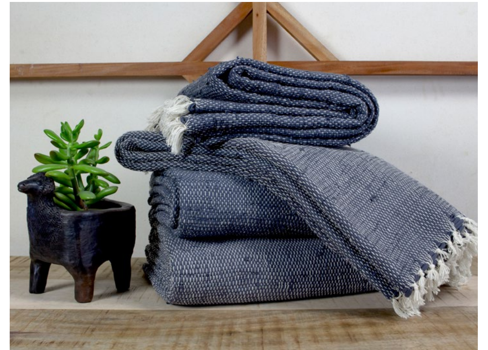
VINTAGE INDIGO RJ1025