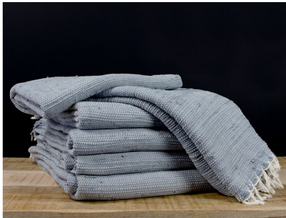
SAGE GREEN RJ1030