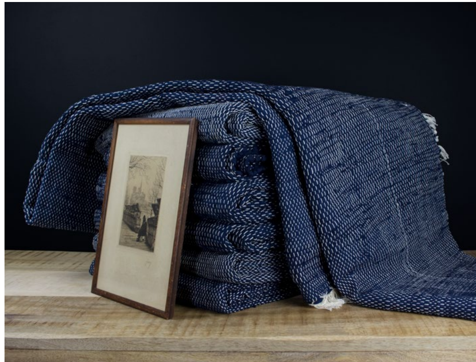
NAVY BLUE RJ1020