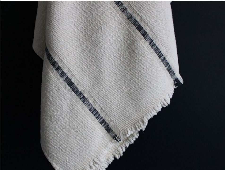
OLIMPIA STRIPE BH2310