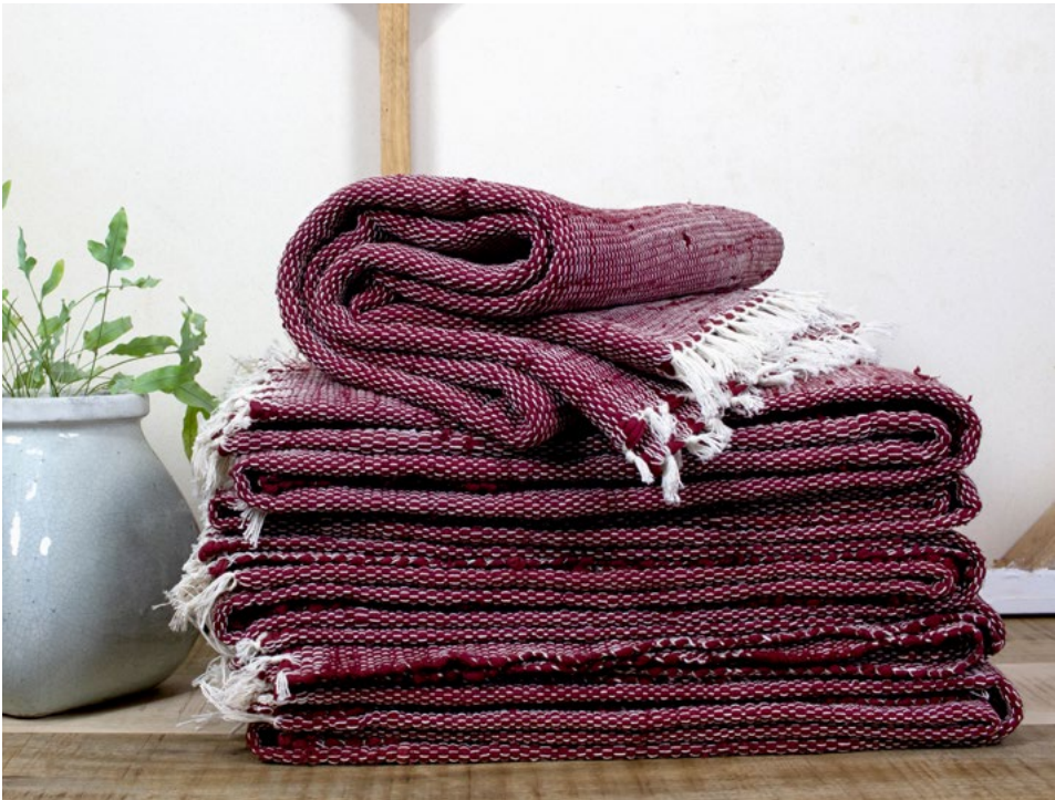
TIBETAN RED RJ1060