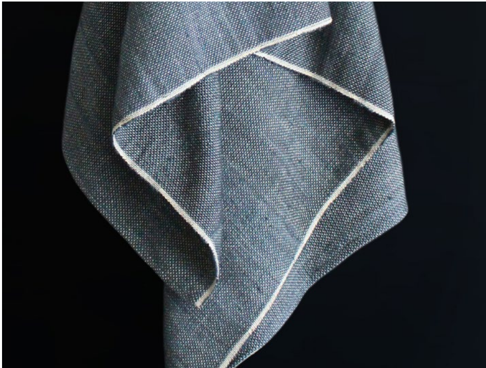
SELF-EDGED (SE) INKWELL BH1119